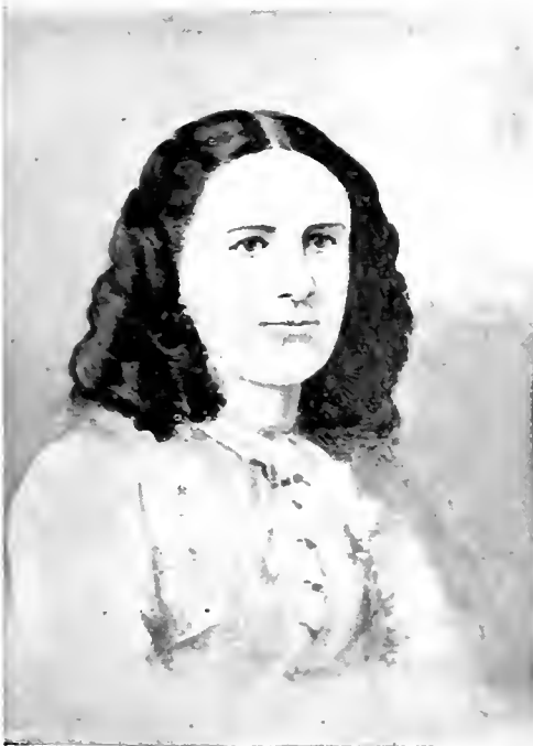
LAURA DE FORCE GORDON.

She was admitted to the bar of the United States Supreme Court, 3rd February, 1887, being the second woman allowed to plead before that high court. She is now located in Stockton, Cal.